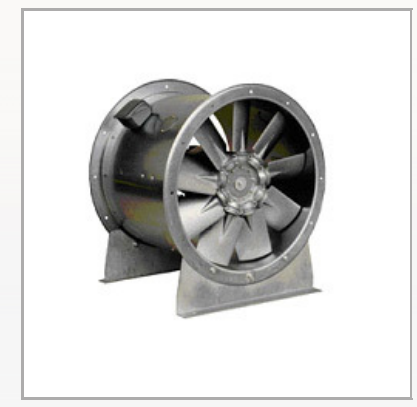
Axial Flow Fan Direct Driven type (Smokespill)

We are recognized in the market as one of the prominent manufacturer and supplier of Axial Flow Fan.