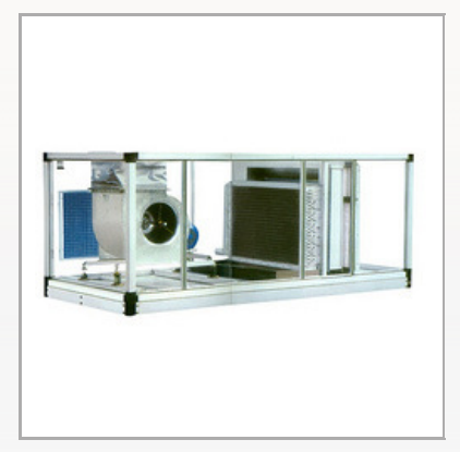
Air Handling System

We are recognized in the market as one of the prominent manufacturer and supplier of Air Handling Unit.