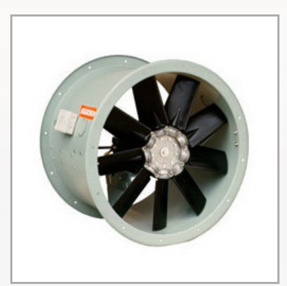
Axial Flow Fan Direct Driven Type