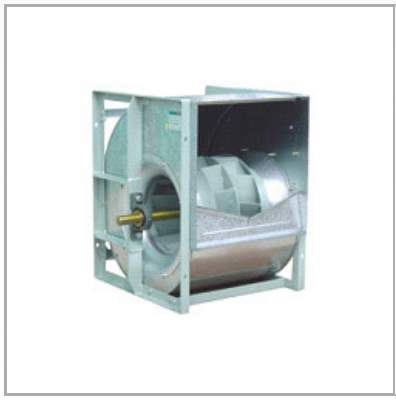
Double Inlet Centrifugal Fans -Forward Curved