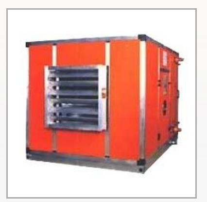
Double/Single Skin Air Handling Units