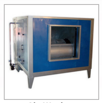
Air Washer Evaporative Cooling Machine