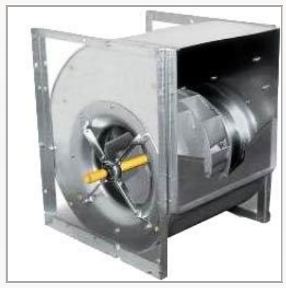
Kitchen Exhaust System

We are involved in offering Air Cooling Units that are precisely engineered to ensure flawless functioning. Our engineered cooling systems are known among our clients for efficient functioning, precision engineering, sturdy construction and optimum performance.