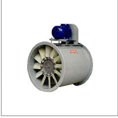
Axial Flow Fan Belt Driven Type