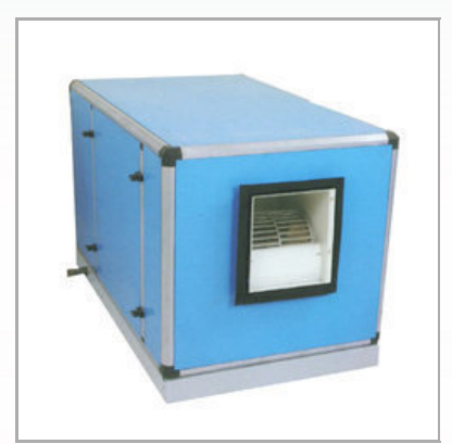
Industrial Air Handling Unit